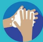
SCRUB: 20 SECONDS