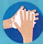
SCRUB: 20 SECONDS