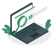
Automated Enrollment & Digital Forms