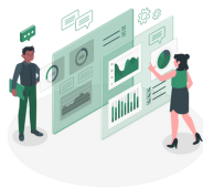
Employer Dashboard with Impact Metrics