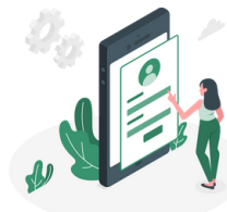
Turnkey Communications Resources